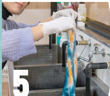
5 Wash with water