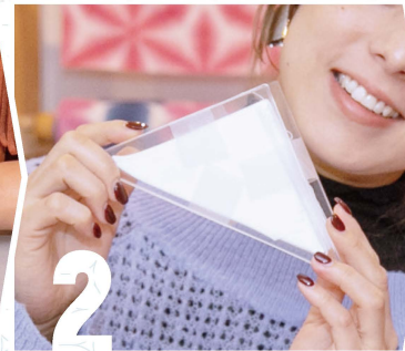
2 Clamp it between boards