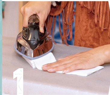
1 Fold the fabric