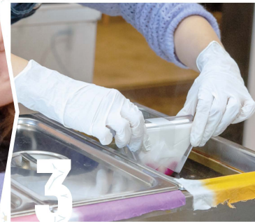
3 Dye it